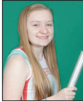
Elsbeth Colson Gildea Award