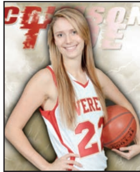
Savannah Spinney Pisacreta Award